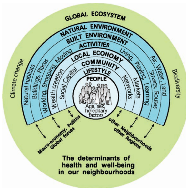
Figure 1.1 Settlement Health Map (78)

Health inequalities, as documented in the Planning for Health Technical Research Paper (2015), is a term used to describe the differences in health status between individuals or groups, as measured by (for example) life expectancy, mortality or disease. Health inequalities are preventable differences in health status experienced by certain population groups. People in lower socio-economic groups and/or more deprived areas are more likely to experience chronic ill-health and to die earlier than those who are more advantaged (79) .