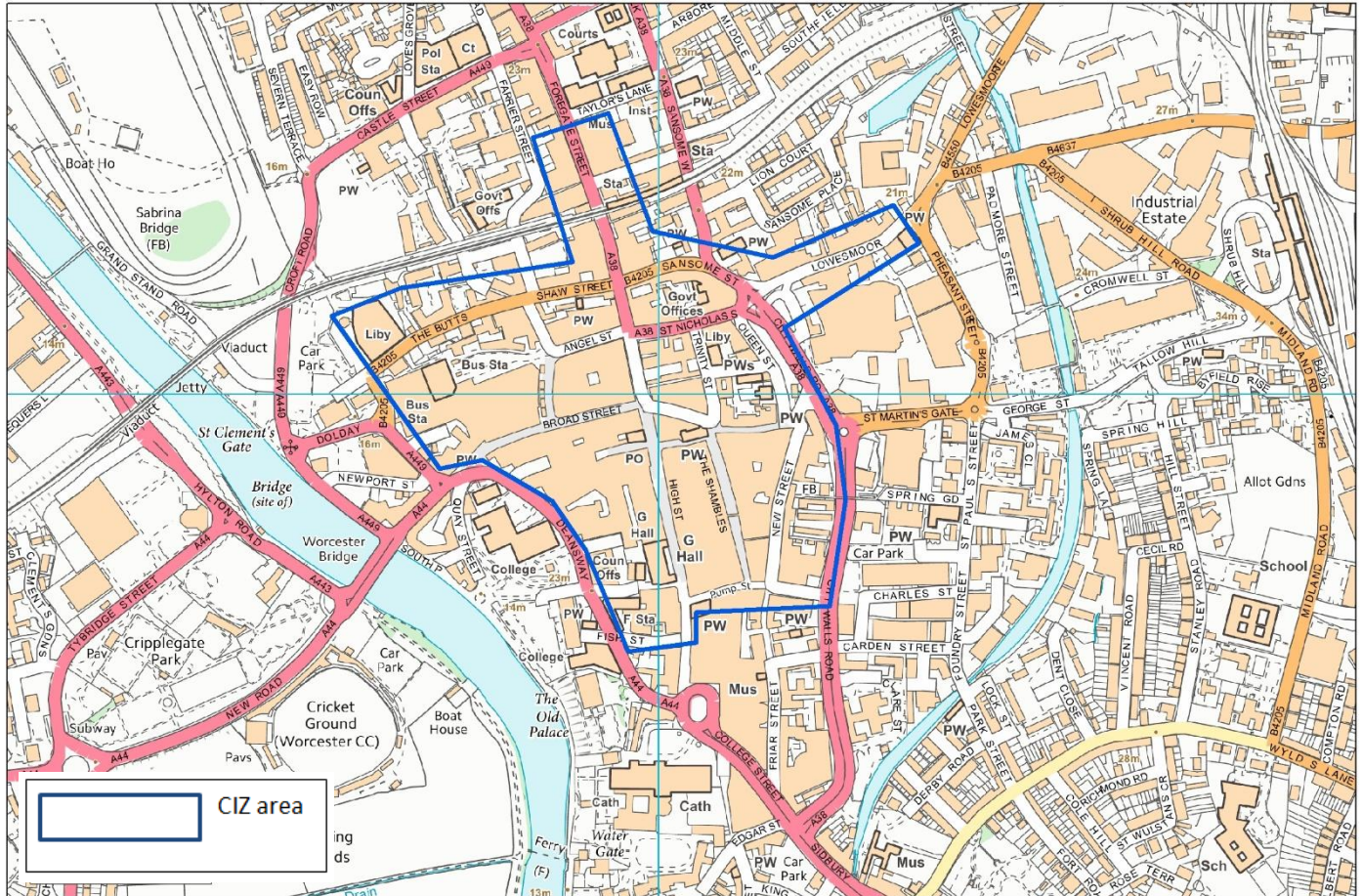
Cumulative Impact Zone

Cumulative Impact Zone based on consideration of hotspot analysis and top 10 locations for recorded alcohol related incidents and crimes between 2016 and 2018.